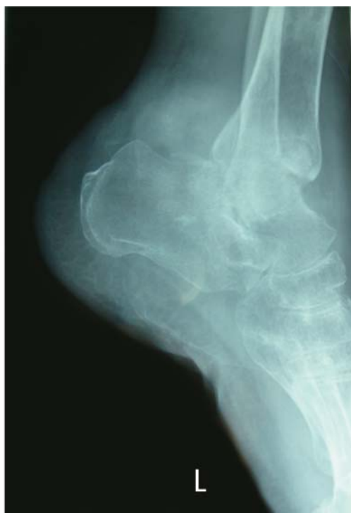
Figure 2 Radiograph of the left ankle (antero-posterior (left) dan lateral view (right)) showing periosteal destruction of the calcaneus, talus, and parts of the proximal tibia with narrowing of the ankle joint space.