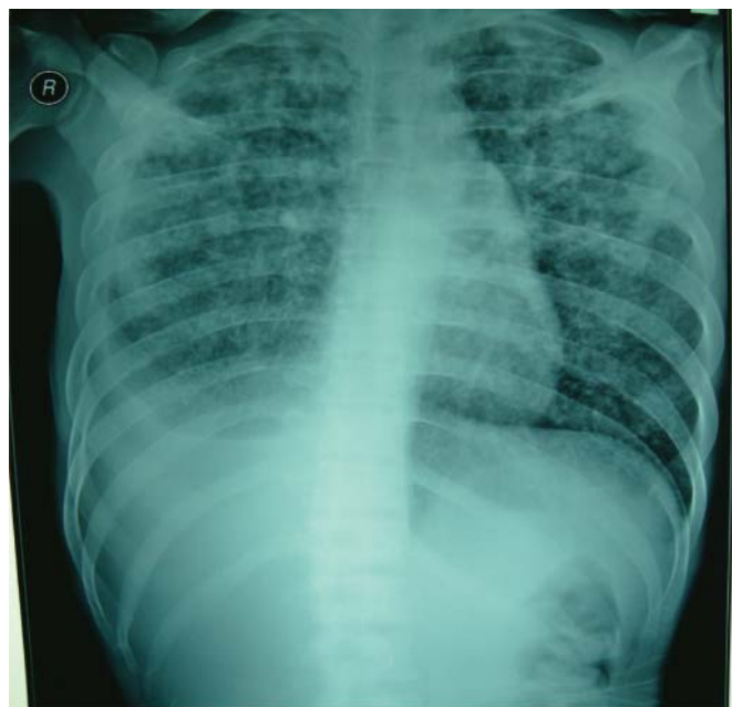
Figure 1 Chest radiograph (postero-anterior view) showing miliary tuberculosis and right pleural effusion.

biopsy specimen taken from the calcaneus. Histopathological examination showed caseation necrosis with surrounding lymphocytes and other chronic inflammatory cells (figure 3). The patient was then discharged and planned for regular evaluation in the outpatient clinic.